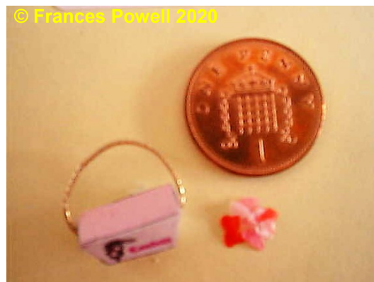
1:12 th scale confetti box shown above

Additional requirements: scissors, craft knife, paper glue, thin card (such as cereal box), tapestry or darning needle, thin cord or ribbon.